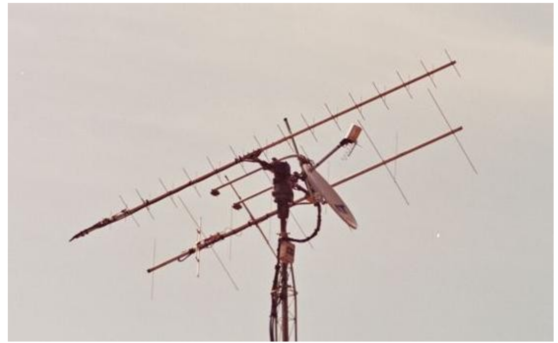
Side view of a typical aerial system of a base station for amateur satellites