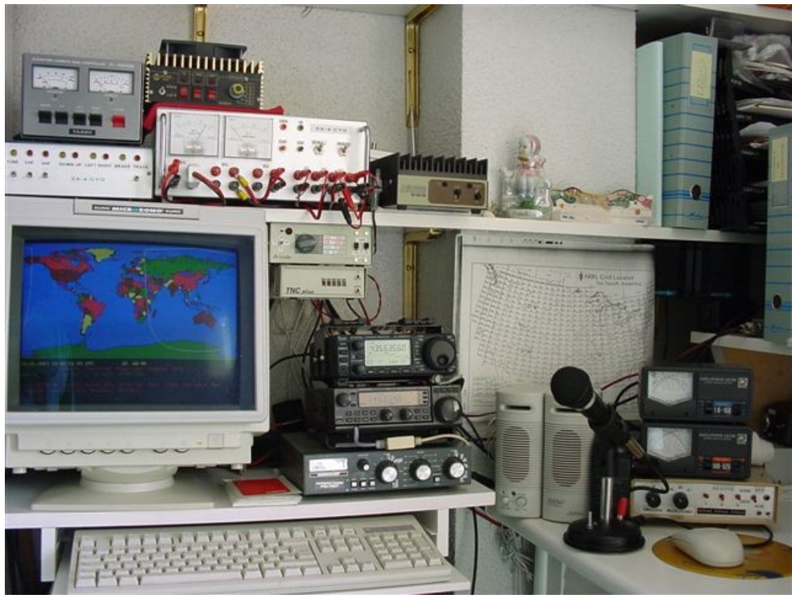
Simple station to work satellites (EA4CYQ)

This is a multi-purpose setup which will let us work not only satellites but also terrestrial communications in FM and SSB mode in an excellent way, and we can test some interesting modes such as listening to EME, etc.